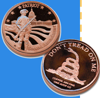
Patriot Second Amendment Medallion

** Please note that your 2025 American Legion or VFW Dues must be paid up. Membership Roster will be verified. EX: Non-American Legion members that are joining with a spouse, both combined, dues total $320.00.